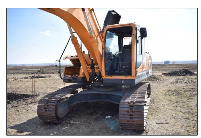
Figure 2: Theft at excavator