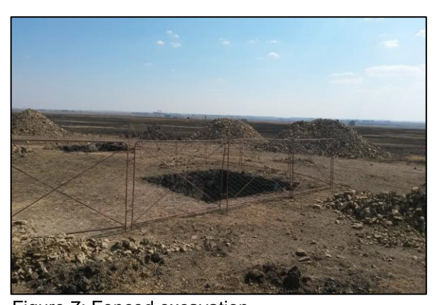
Figure 7: Fenced excavation