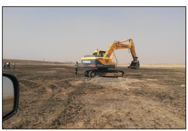
Figure 5: Excavator commencing with excavation